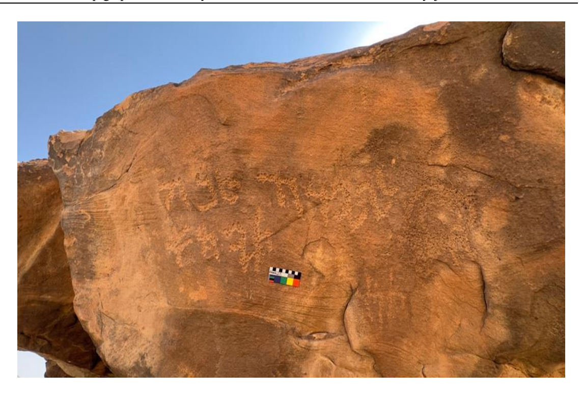
Fig. 1-A short Aramaic epigraphic miscellany from Al-A'ērḍiyyeh.