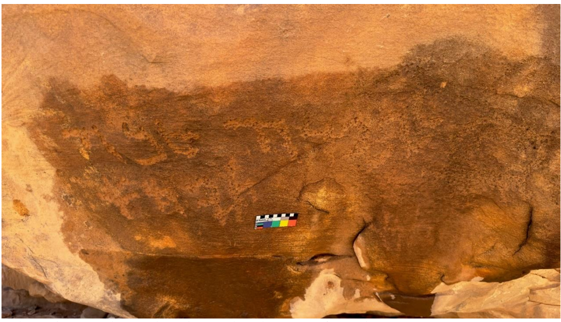
Fig. 3-A short Aramaic epigraphic miscellany from Al-A'ērḍiyyeh.