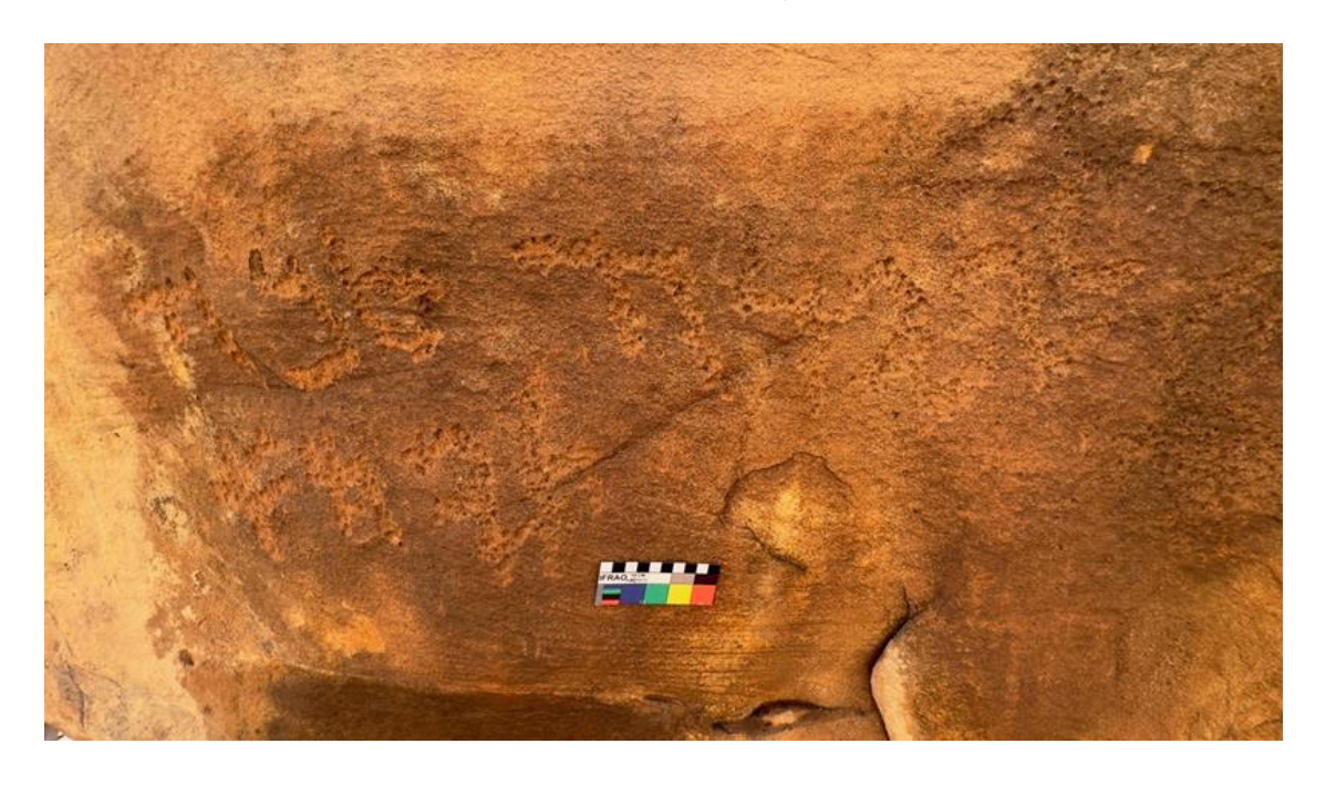
Fig. 2-A short Aramaic epigraphic miscellany from Al-A'ērḍiyyeh.