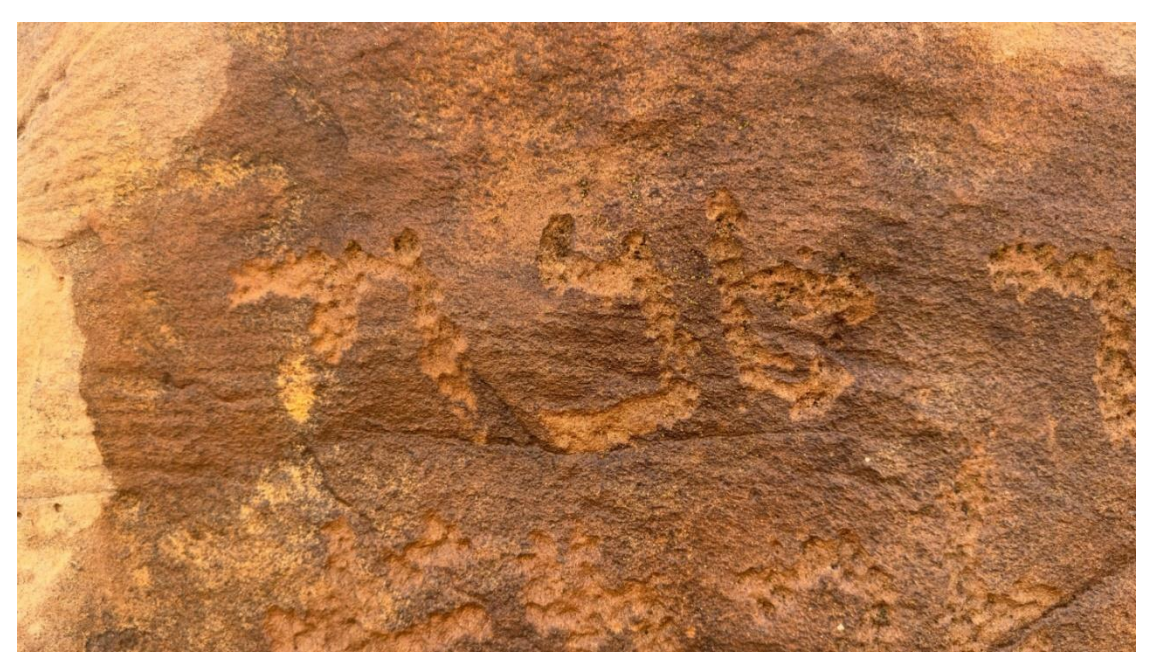
Fig. 5-A short Aramaic epigraphic miscellany from Al-A'ērḍiyyeh. (Photo by Mamdouh Alfadhel).