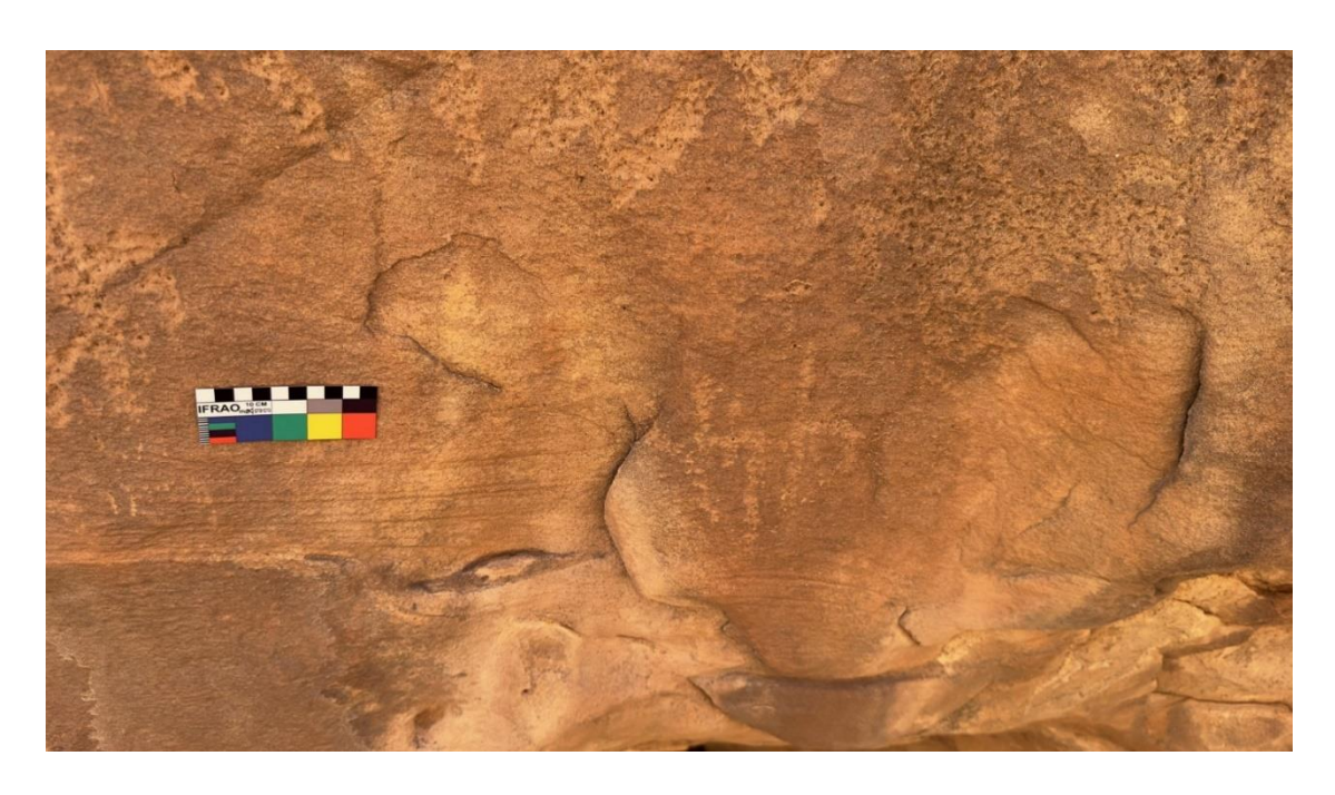
Fig. 7-A short Aramaic epigraphic miscellany from Al-A'ērḍiyyeh.