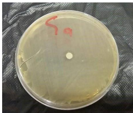
Figure (5): Antifungal susceptibility test for Candida albicans against Acrosoft mixed with Ginger oil (zone of inhibition 1mm)