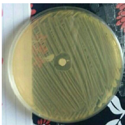
Figure (2): Antifungal susceptibility test for Candida albicans against Acrosoft tissue conditioner mixed with Organium oil (zone of inhibition 9 mm)