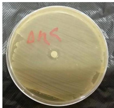
Figure(3): Antifungal susceptibility test for Candida albicans against Acrosoft tissue conditioner mixed with Black seed oil (zone of inhibition 5mm)